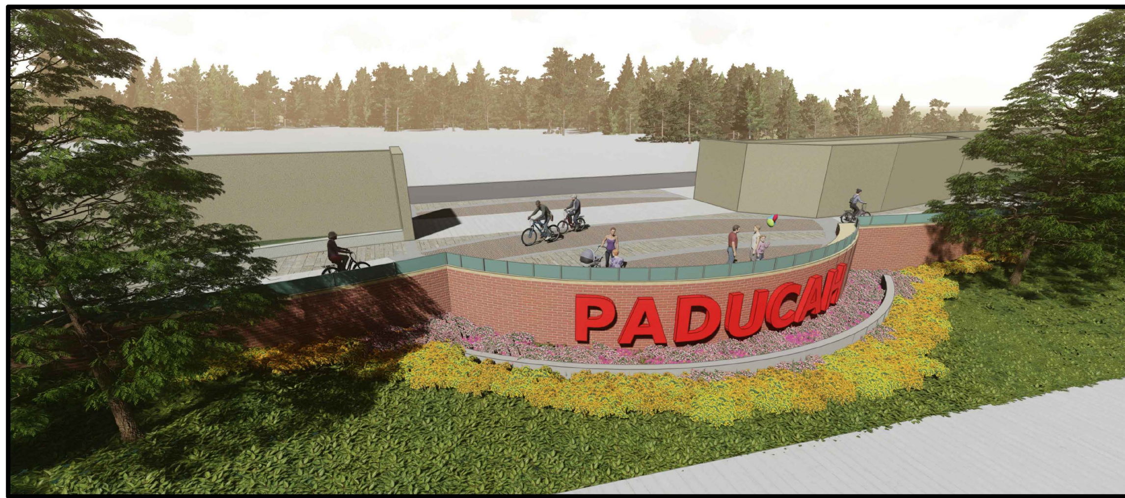
A BOAT DOCK OVERLOOK PLAZA Not To Scale