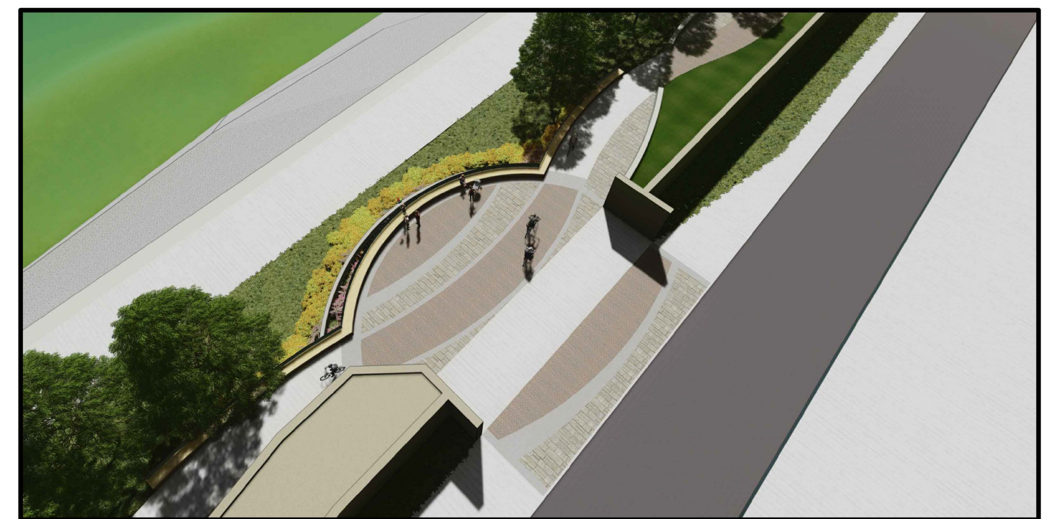
B BIRD'S EYE VIEW OF DOCK OVERLOOK PLAZA Not To Scale

Shade Tree Plantings and Tall Grasses on Slopes